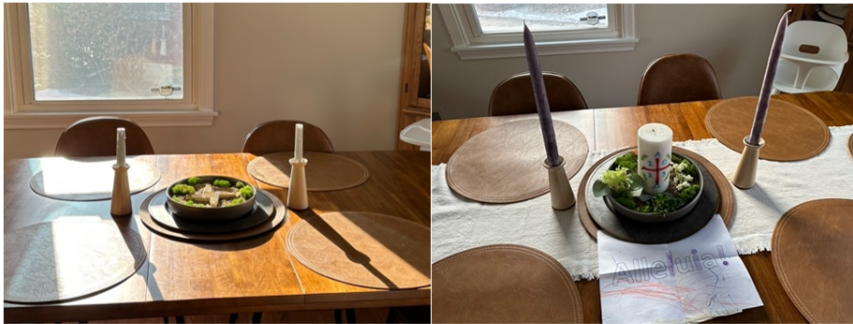
Our Lenten Garden transforms during Holy Week