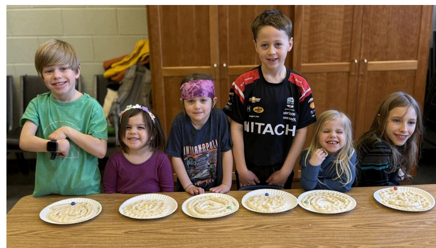
Our Faith Formation kiddos making communion bread and salt dough spirals to count the 40 days of Lent.