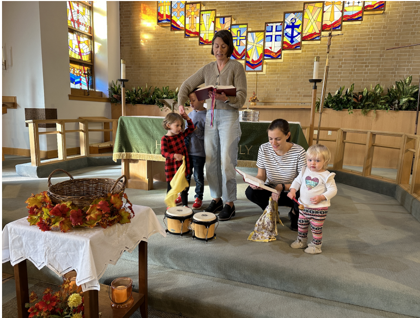
Thanks to our youngest worshippers for sharing the gift of music with us on November 19!

During the Advent/Christmas season there will be a Christmas tree placed in the sanctuary where we will be collecting hats, mittens, and scarves. We will collect items through Jan. 7. At the end of this drive, we will donate all the hats, mittens and scarves to Naomi Family Residence, a local homeless shelter for women and children. Thank you for participating in this worthy cause!