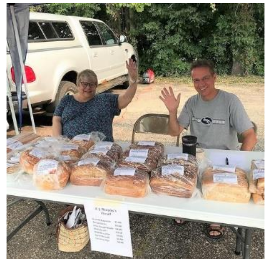
The baked goodies are always a big hit at the St. Luke Farmer's Market!

We need volunteers for the Farmers Market at St. Luke Saturdays, through October 7! ( Note: the market will be closed July 1 in observance of Independence Day. ) You may work a single shift: 730am to 1030am OR 1030am to 130pm, OR a double shift: 730am to 130pm. Most of the work is in the first and last half hour--just setting up tables and signs, etc.--the rest of the time you mostly sit and greet the shoppers, bask in the morning sun and take in the wonderful sights, sounds and aromas of our small but lively, thriving market! June and July are scheduled, but we have openings August 5 and 19, every Saturday in September, and October 7. If you are willing and able to help, please let Wendy Bjorklund know asap at wlbjorklund@stcloudstate.edu . Also, we will be collecting donations for the Farmers Market through our Sunday offering jar; this is another great way to support this worthy cause. THANKS IN ADVANCE for your support! We can't do this without you!